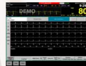
Full Disclosure of ECG waveforms 10 second display