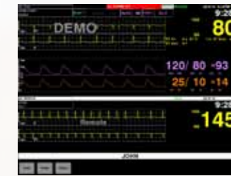
Remote Bed View and Alarm Watch