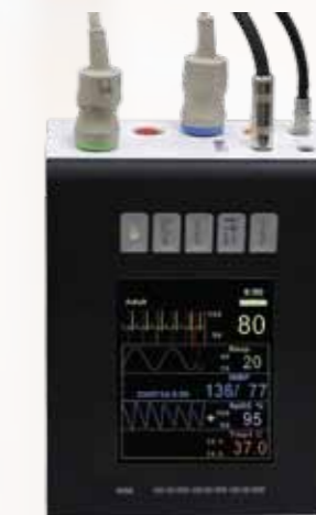
Portrait Linear Waveform View

During transport the display characteristics will change according to the position of the MX57 Module