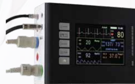
Landscape Big Number View