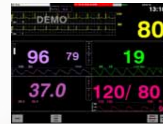
Very Big Number display