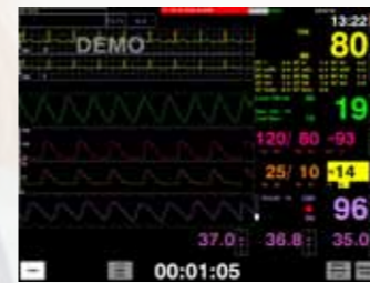
Vital Signs and waveform display