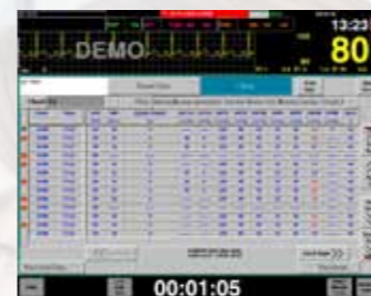
Vital signs chart with up to one minute resolution